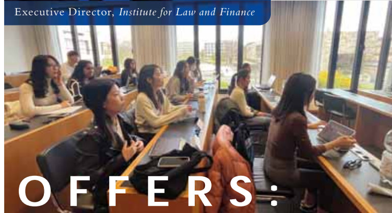
Executive Director, Institute for Law and Finance